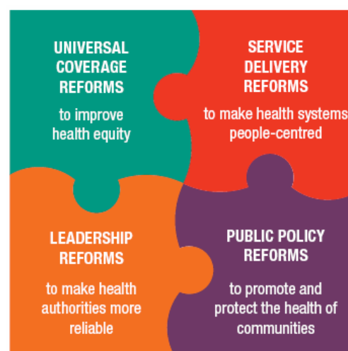
Fig. 1: The four primary health care goals

The Commission on Social Determinants of Health, set up in 2005 by former WHO Director-General Lee Jong-wook, reported in August 2008 making strong arguments for tackling inequities in health.